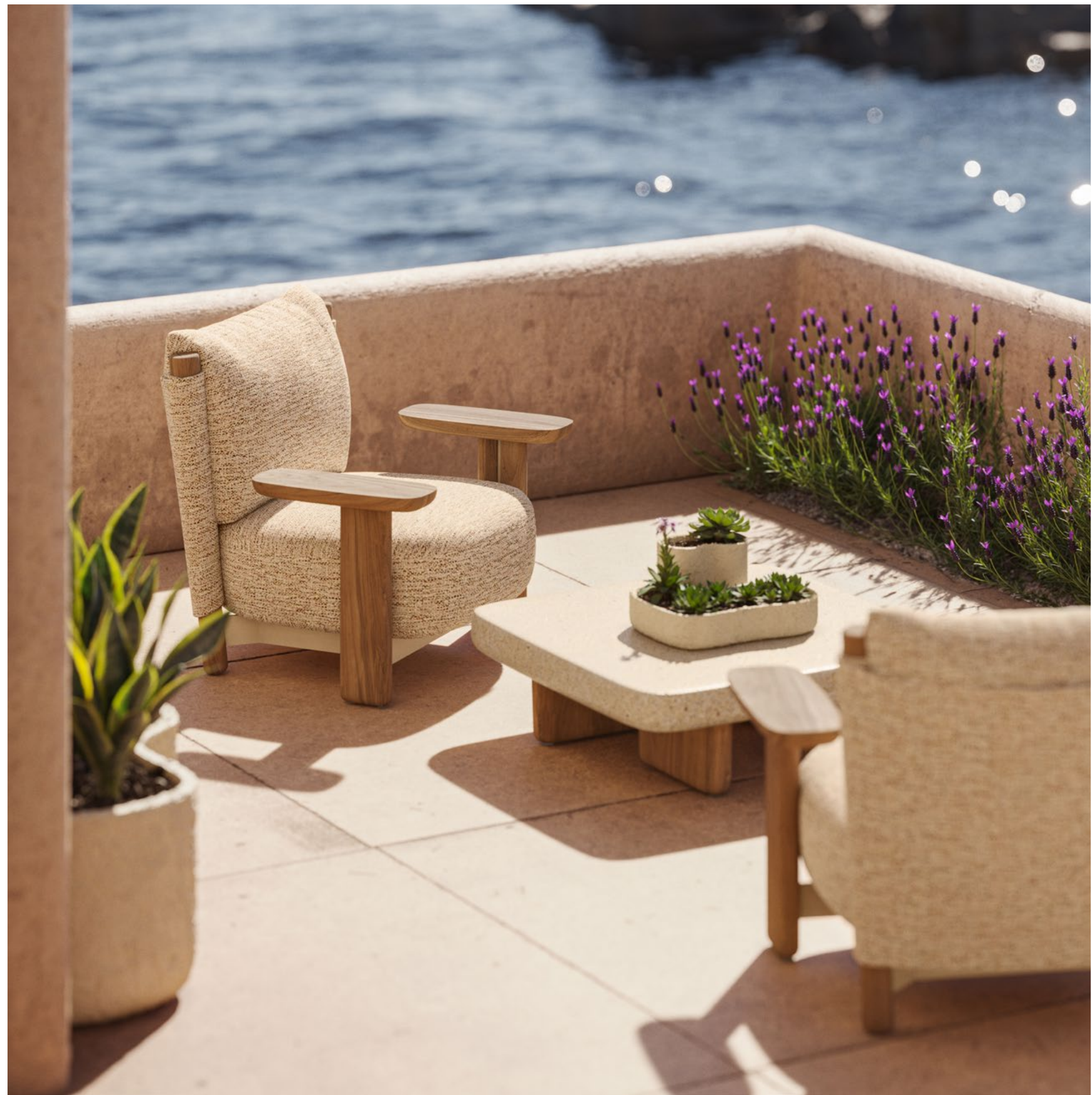
P. 19 Milos Wooden Lounge Chair. Natural Teak, Cream 5037 and Ribadeo Cream 10323 Milos Coffee table. Natural Teak and Concrete Cream 9100