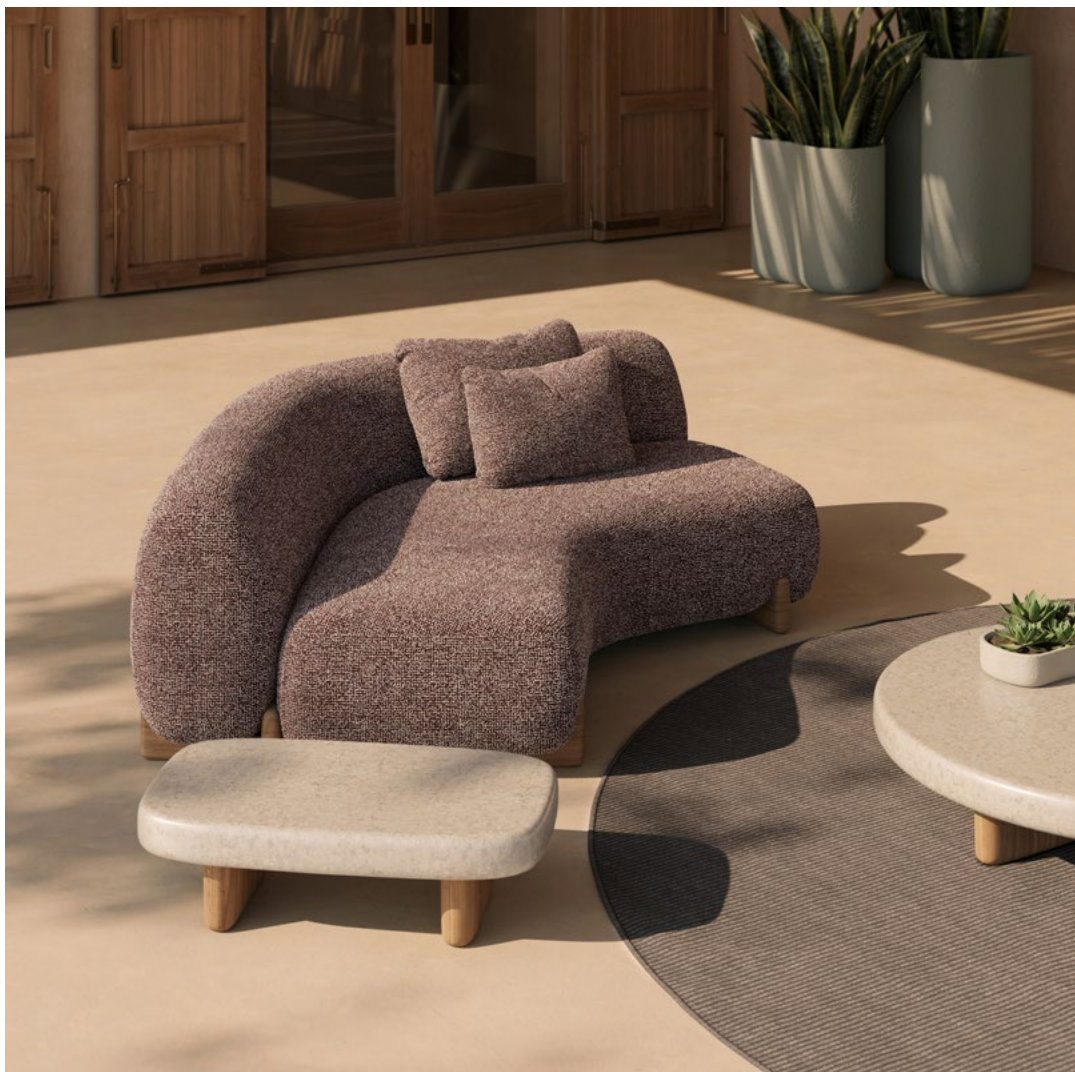
P. 22—23 Milos Wooden Lounge Chair and Sectional Sofa. Natural Teak, Cream 5036 and Zumaia Garnet 10202 Suave Cushions. Zumaia Garnet 10202 Milos Coffee Table. Natural teak and Concrete Cream 9100 Milos Planters and nano planters. Cream 2017