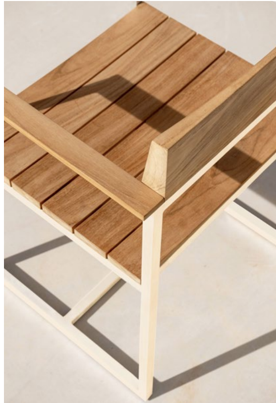
P. 58—59 Vineyard Table and Chair. Cream 5036 and Natural Teak Vineyard Planter L. Cream 5036 and Natural Teak Vineyard Sun Lounger. Cream 5036, Natural Teak and Getaria Cream 10047