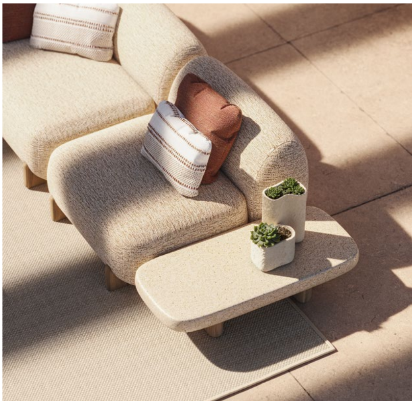
P.18 Milos Sectional Sofa. Natural Teak, Cream 5037 and Ribadeo Cream 10323 Milos Coffee Tables. Natural Teak and Concrete Cream 9100 Suave cushions. Ribadeo Clay 10326 and Moraira Clay 10361 Milos Puff XL with back cushion and puff M. Natural Teak and Ribadeo Cream 10323 Nano planters and planter. Cream 2017